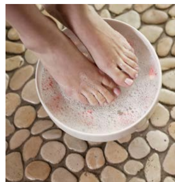
Giving yourself a time-out is a healthy way to deal with stress.