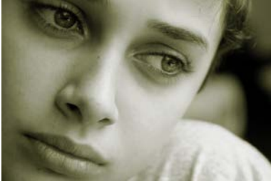
It is common for a woman to feel sad or tearful after her pregnancy is over.